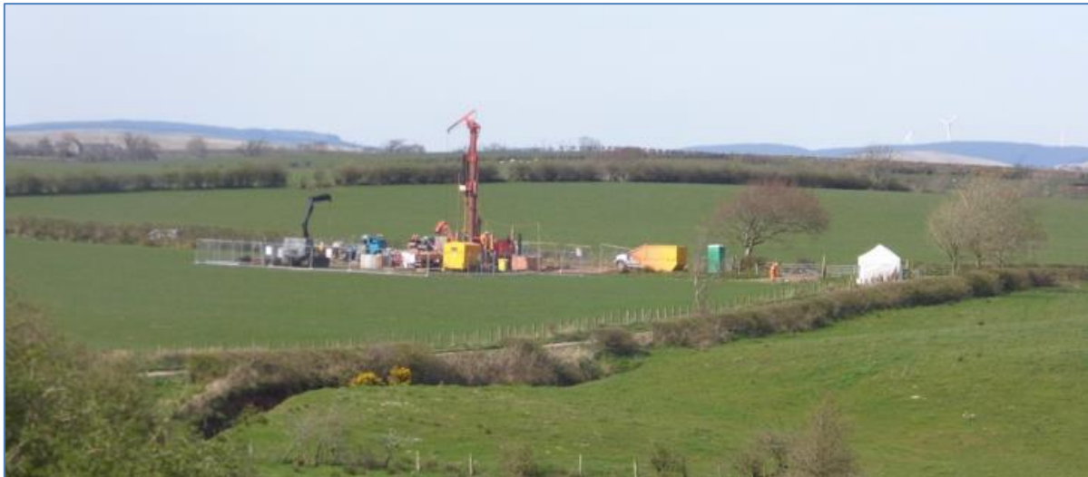
Figure 1 Priority Drilling Set Up on LCL-033

The Phase 1b program was designed to infill the Inferred Resource, currently 112 million tonnes, in the western and central areas of the licence and aimed at upgrading part of this Resource from Inferred to Indicated status. The location of the Phase 1b boreholes in relation to the Lochinvar Inferred Resource and Exploration Target is presented in Figure 2.