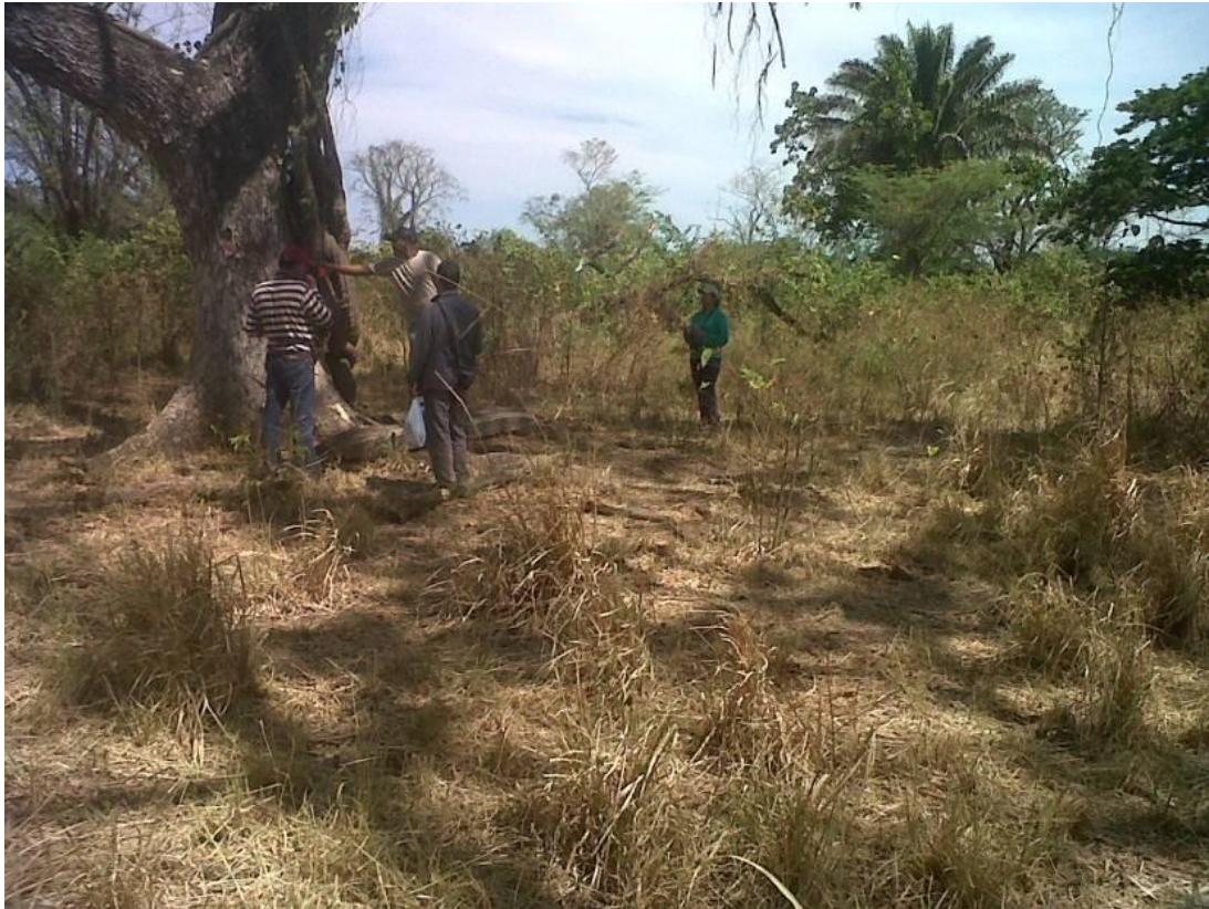
Figure 2: Proposed location for the first borehole to be drilled (LM2)